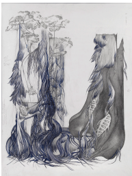
Decay, Water Hemlock, Glabrous Protuberance, Hair Loss, Queen Anne's Lace, Modern Sculpture, Hirsutism and Multi-species Competition. , 2019 Graphite and ballpoint pen on paper 94 x 70.5 inches 182.9 x 139.7 cm MM 18919