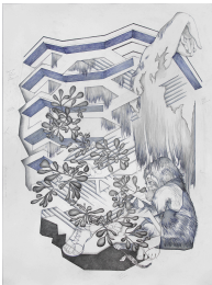
Lenape, da Verrazzano, Patrician Sandal, New Amsterdam, Vessel, Wonderment, Rue, Mutagenic Growth, Hepatic Toxicity. , 2019 Graphite and ballpoint pen on paper 94 x 70 1/2 inches 238.8 x 179.1 cm MM 19507