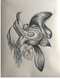
WEED: Our Lady of the Flowers (Aconitum) , 2020-21 Graphite and ballpoint pen on paper, in artist frame 53 x 38 inches 134.6 x 96.5 cm MM 19502