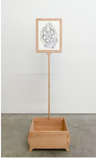
HOT BOX PROTOTYPE SERIES A: Master Bloviator Upended, Song of the Cetacea , 2021 Rift sawn Kentucky Red Oak, indoor compost concoction, graphite and ballpoint pen on paper Overall: 72 x 22 x 16 inches (182.9 x 55.9 x 40.6 cm) Drawing: 17 x 13 inches (43.2 x 33 cm) MM 19499