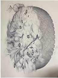
Monarch's Meal, Asclepias syrica, Danaus plexippus, Hevea Brasiliensis, Mentha pulegium. , 2020-21 Graphite and ballpoint pen on paper 94 x 70 1/2 inches 238.8 x 179.1 cm MM 19508