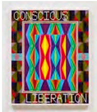
CONSCIOUS LIBERATION , 2020

Acrylic on deer hide, glass beads and artificial sinew inset into wood frame 34.5 x 28.875 inches 87.6 x 73.3 cm JeG 19227