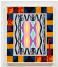
FIRE , 2020

Acrylic on deer hide, glass beads and artificial sinew inset into wood frame 34.5 x 28.875 inches 87.6 x 73.3 cm JeG 19228