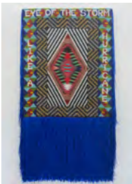
EYE OF THE STORM LIKE A HURRICANE, 2020

Trading post rug, acrylic felt, canvas, glass beads, artificial sinew, copper beads, brass and steel studs, nylon fringe, nylon thread