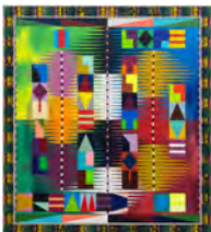
I HOPE YOU'LL HAVE ALL THAT YOU HAVE DREAMED OF, 2020

Acrylic on canvas, glass beads, artificial sinew, inset to custom wood frame