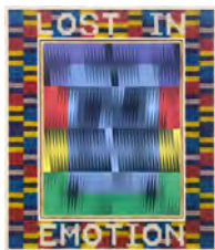
LOST IN EMOTION , 2020

Acrylic on hide, glass beads and artificial sinew inset into wood frame 34.5 x 28.875 inches 87.6 x 73.3 cm JeG 19319