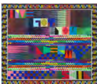
I'VE GOT YOU UNDER MY SKIN, 2020

Acrylic on canvas, glass beads and artificial sinew inset into wood frame