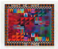
WHAT WE WANT IS FREE, 2020

Acrylic on canvas, glass beads and artificial sinew inset into wood frame