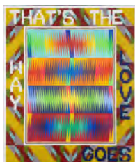
THAT'S THE WAY LOVE GOES , 2020

Acrylic on hide, glass beads and artificial sinew inset into wood frame 34.5 x 28.875 inches 87.6 x 73.3 cm JeG 19320