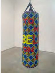
TO FEEL MYSELF BELOVED ON THE EARTH, 2020

Found punching bag, expanding foam, acrylic felt, plastic beads, glass beads, artificial sinew