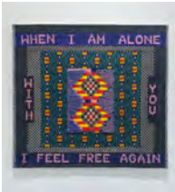
WHEN I AM ALONE WITH YOU I FEEL FREE AGAIN, 2020

Trading post rug, acrylic felt, canvas, glass beads, nylon thread, brass and steel studs